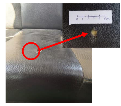
Fig. 3: Hole found at the mid of the back seat of the car.