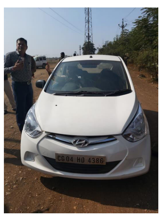
Fig. 6: Crime scene reconstruction at the actual site of the incident.