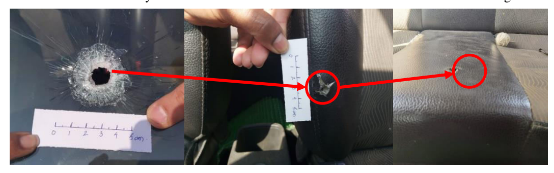
Fig. 4: Estimated path of the first bullet.

• The estimated path of the first bullet: entry from the windscreen glass of the car then hits the corner of the side seat of the driver and then finally made a hole at the mid of the back seat of the car as shown in Fig. 4.