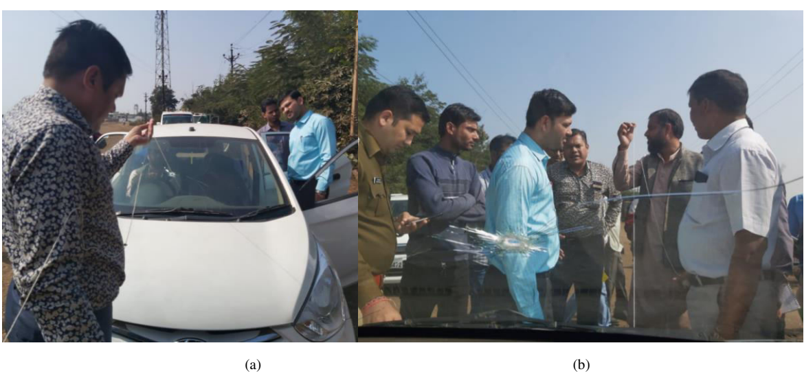
Fig. 7: (a) Direction estimation of the first bullet by authors and (b) direction estimation of the first bullet was also done by the victim in the crime scene reconstruction.