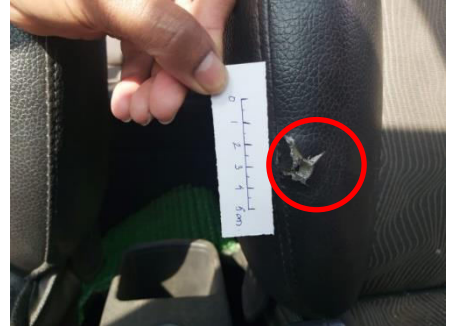
Fig. 2: Hole found at the corner of side seat of the driver.

The inside observation of the car was then performed in which a hole was found at the corner of side seat of the driver (Fig. 2) and the next hole is found at the mid of the back seat of the car (Fig. 3).