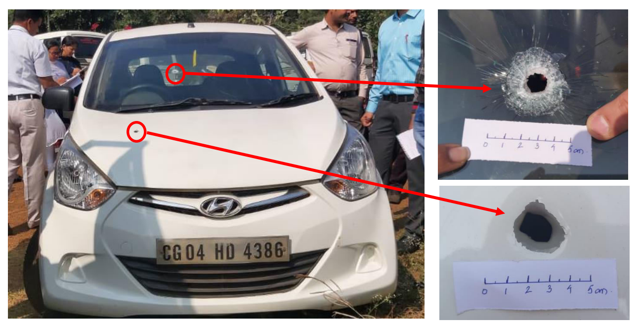
Fig. 1: Two holes found on the car.

After taking statements, the initial observation of the car was performed by the authors at the police station, in which two holes: the first of size 1.8 \text{ cm} \times 1.6 \text{ cm} located at the slightly right-mid part of the windscreen glass and the second of size 1.25 \text{ cm} \times 1.5 \text{ cm} present at the slightly right side of the bonnet of the car have been found as shown in Fig. 1. The close observation of both the holes reveals that they were made by the impact of bullet.