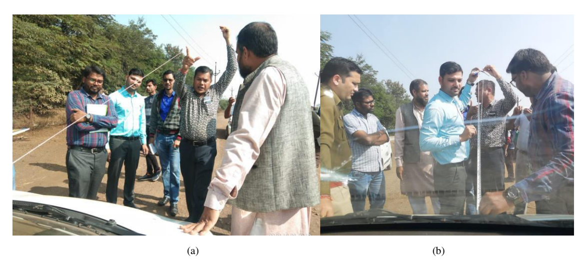
Fig. 8: (a) Height of firing measurement as per authors and victim and (b) Firing distance measurement from the front of the car in the crime scene reconstruction.

• Finally, one empty cartridge of 7.65×17 mm calibre was found on the road near to left side of the car (Fig. 9).