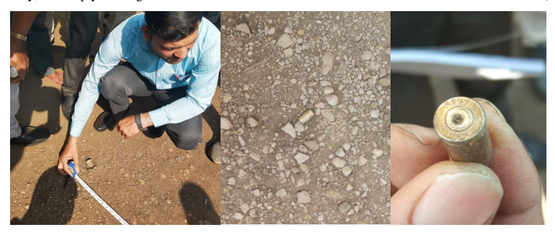
Fig. 9: One empty cartridge of 7.65 mm calibrewas found on the road near to left side of the car.

• Finally, one empty cartridge of 7.65×17 mm calibre was found on the road near to left side of the car (Fig. 9).